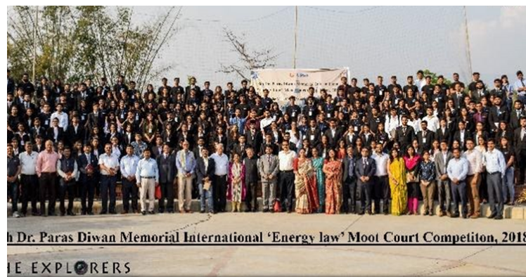
VIII UPES- Dr. Paras Diwan Memorial International 'Energy Law' Moot Court Competition, 2018