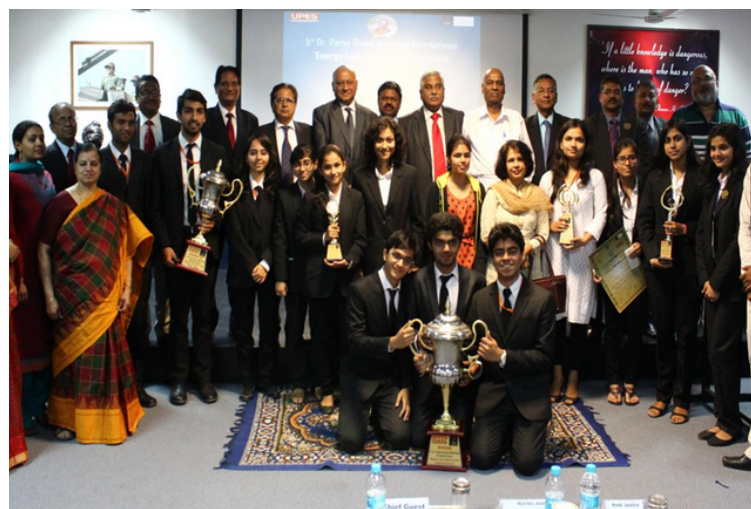
V UPES- Dr. Paras Diwan Memorial International 'Energy Law' Moot Court Competition, 2015