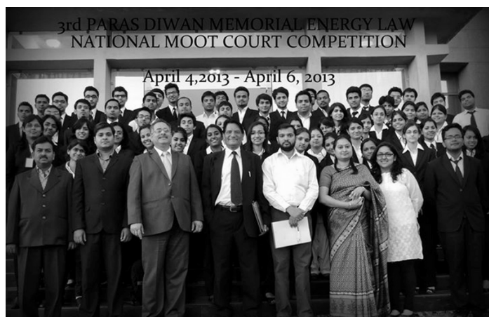
III UPES- Dr. Paras Diwan Memorial International 'Energy Law' Moot Court Competition, 2013