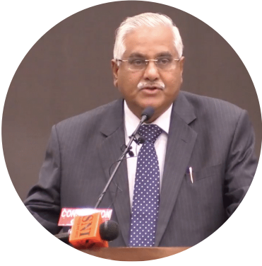
Hon'ble Mr. Justice V. Gopla Gowda, Sitting Judge, Supreme Court of India