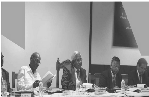
I UPES- Dr. Paras Diwan Memorial International 'Energy Law' Moot Court Competition, 2011