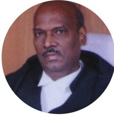
Hon'ble Mr. Justice P. Narayana, Judge, High Court of Andhra Pradesh