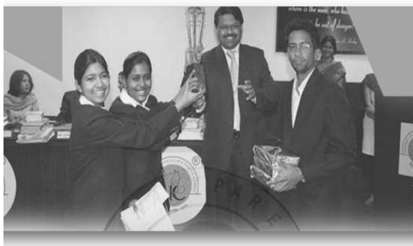
II UPES- Dr. Paras Diwan Memorial International 'Energy Law' Moot Court Competition, 2012