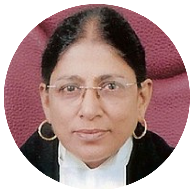
Hon'ble Ms. Justice (Retd.) Manju Goel, Judge, High Court of Delhi