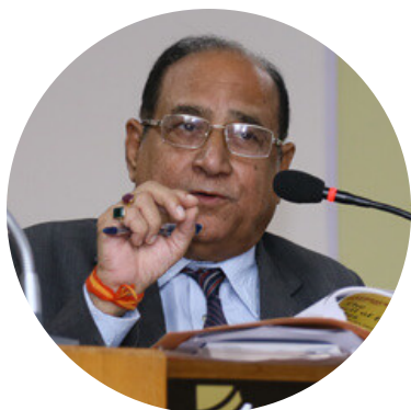
Hon'ble Mr. Justice Rajesh Tandon, Member, State Human Rights Commission and Former Judge, High Court of Uttarakhand