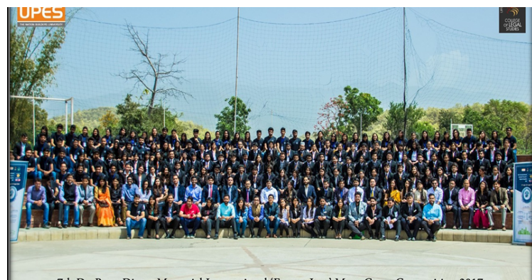
VII UPES- Dr. Paras Diwan Memorial International 'Energy Law' Moot Court Competition, 2017